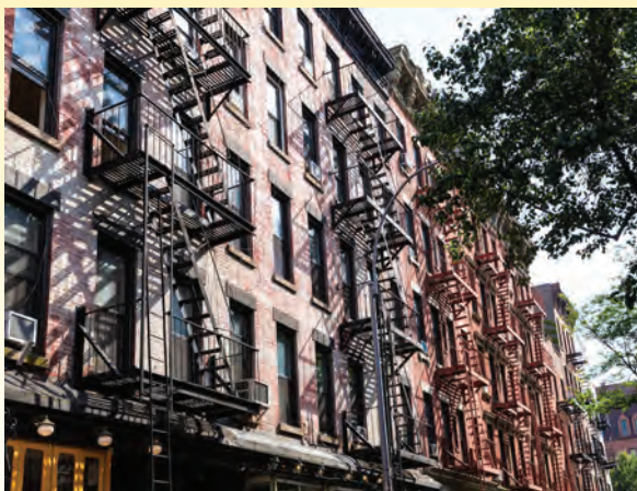
Multi-Family Structures with loads GREATER THAN 1,000 SCFH

A Curb Valve may be installed in lieu of an EFV at: