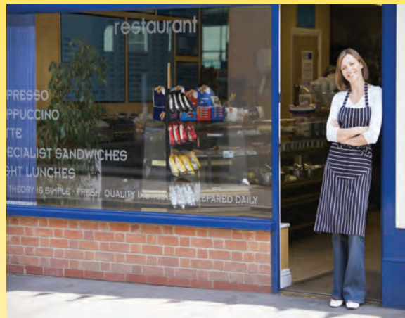
Single Commercial services with loads UP TO 1,000 SCFH