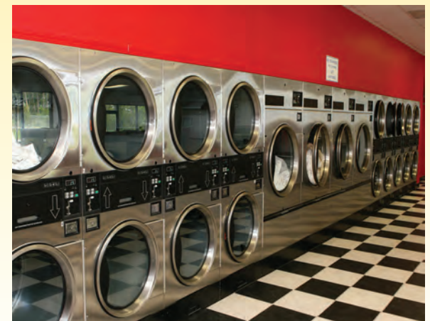
Single Commercial services with loads GREATER THAN 1,000 SCFH