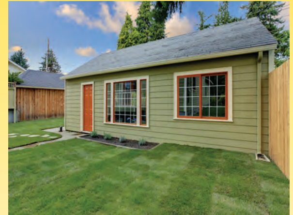
Branch Services (new or previously installed) regardless of load

A Curb Valve may be installed in lieu of an EFV at: