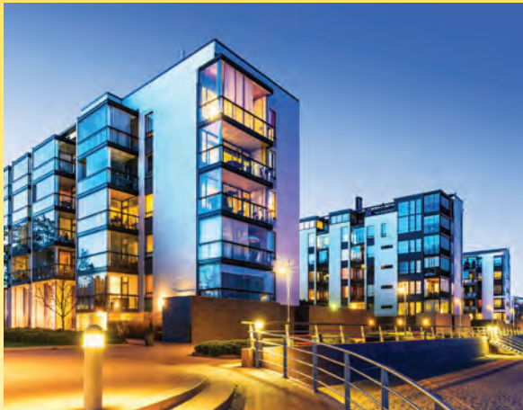
Multi-Family Structures with loads UP TO 1,000 SCFH

In addition to single family residences, EFVs are now required at: